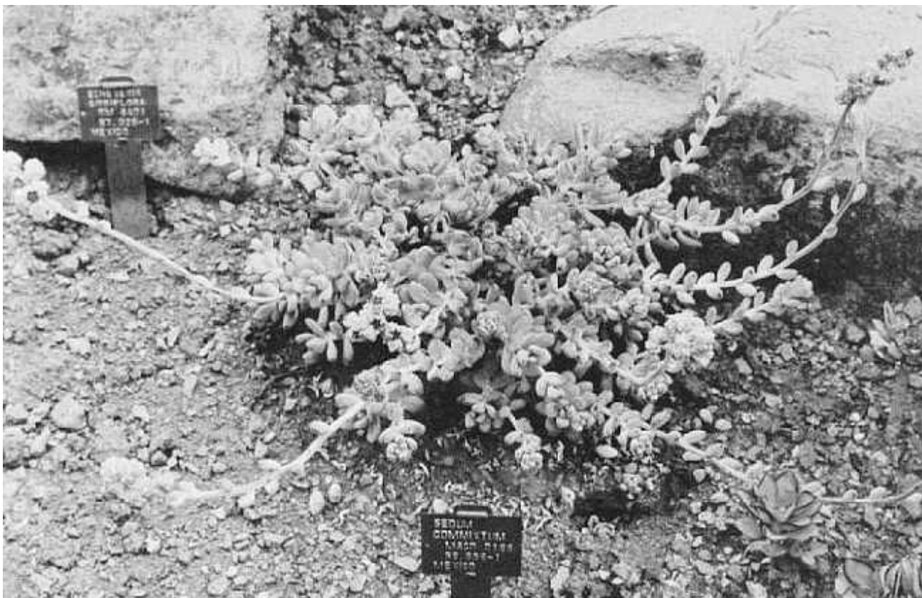
Fig. 1. Sedum commixtum at the U.C. Botanical Garden, 1961.

First publication in CSJA Vol.52, N°4, 1980.