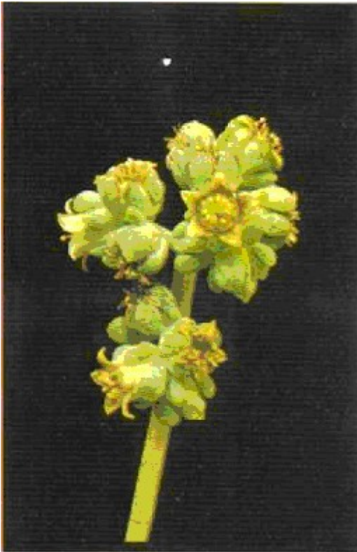
Fig. 3. Flowering branch of S. commixtum , at U. C. Botanical Garden, 18 June 1964. x 1.8.

with sides slightly channeled, the limb 7-8 mm wide, the segments in bud imbricate, in anthesis gently outcurved with tip slightly recurved, ovate, acute with blunt subdorsal mucro, 3 mm long, 2.5 mm wide, thickened in lower half on either side of filament and thicker than wall of tube, irregularly marked with dark red, especially near margins but also across middle. Stamens 10, the filaments reddish above, the antesealous ca. 5 mm long from corolla base, adnate 3 mm but standing out conspicuously below, the free part \pm subulate, ca. 2 mm long and 0.5 mm wide, the epipetalous adnate ca. 4 mm and not discernable below, the free part (filament proper) ca. 1 mm long and 0.6 mm wide, \pm triangular, flattened and lying in channel of corolla segment; anthers exerted, dull yellow flecked with red, oblong, 1.2 mm long, 0.55 mm wide; antesealous slightly higher than epipetalous. Nectar glands yellowish, truncate, ca. 1.4 mm wide, 0.3 mm high, 0.2 mm